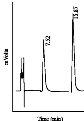
Fig. 2: The chromatogram of Peganum harmala seeds extract: harmine (7.52 min) and harmaline (15.87 min)

Inter and intra-day assay precision and accuracy: The accuracy and precision were determined by preparing three replicate samples of each compound at concentrations of 0.5, 1 and 10 µg mL -1 . The results of the assay showed a mean RSD for within-day as 2.0, 2.8, 3.5 and 1.1% for harmalol, harmaline, harmol and harmine, respectively. The respective RSDs for between-day