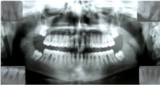
Fig. 2: Orthopantograph and periapical radiography revealed generalized alveolar crest bone loss especially in the anterior parts of jaws and loss of lamina dura in some of teeth

In other regions (from right lateral incisor up to left first premolar), mild gingival enlargement was seen. There were many carious teeth and calculus. Right central incisor and first molar, right and left lateral incisor, were mobile. No neurological abnormality was noted. All the teeth responded positively to pulp testing.