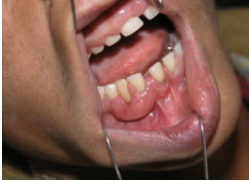
Fig. 1: Intra oral view: The tumor in the first premolar region with intact mucosa and gingival enlargement in maxilla and other parts of mandible