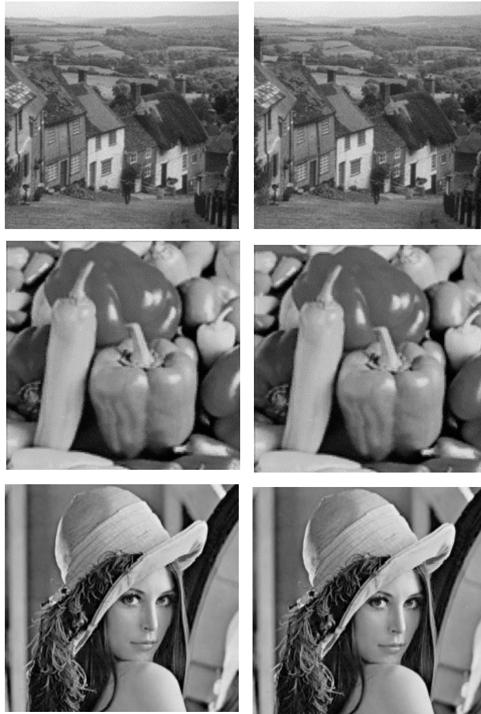
Fig. 2: Three samples of source and decompressed images (256×256) using BPNN VQ

is equal to P \times P (where P is the dimension of the image block). For this reason, we get enhanced VQ codebook with less storage requirement.