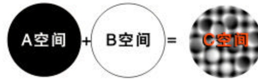
Fig. 4: Second creation theory

Theory of spatial second creation: After analysing the function transformation and convergence method of heterogeneous space, the essence of second spatial creation theory can be roughly summed up as follows: when the buildings with different backgrounds are in an environment, using a combination of use function and