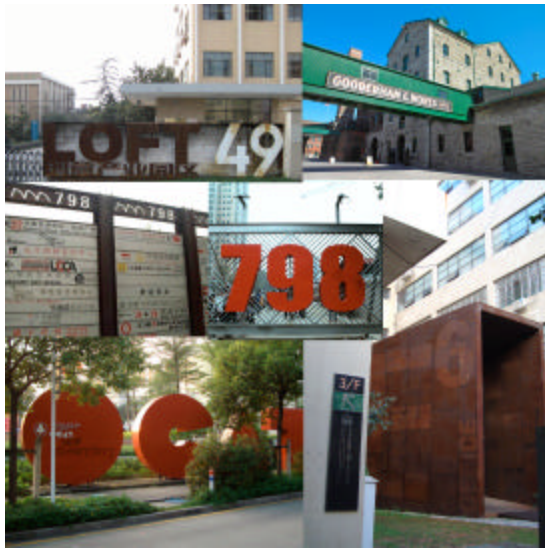
Fig. 5: Environmental signage system for the creative parks