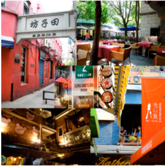
Fig. 6: Scenes of life with full of Shanghai lane atmosphere in Tianzifang on the Taikang street in Shanghai

to modern characteristic commercial district, contains various commercial street with different themes: Cuisine variety street, shopping street, antique street etc. In the area of landscape structure, put emphasis on different commercial atmosphere (or fashion, or old, or full of delight of life). The diversification of the original architectural form, the diversity of space format, the individualization of the overall outlook, the exclusiveness of showcase and storefront style and so on are regarded as the landscape elements of district spatial design. Furthermore, the design of night view for the commercial district is the primary focus of landscape atmosphere design. Tianzifang on Taikang Street in Shanghai is an leisure commercial format with rich overlap of vulgar life and lane scenes (such as living groceries, restaurants, bars, cafes, etc.). The ubiquitous noise, bustling and the remains of foreign culture in old Shanghai neighbourhood as well as the life scenes are interspersed in this commercial district. The mutual landscape penetration of life and business mode shows its spatial feeling with strong local characteristics (Fig. 6). The Sohu creative district in America is also full of classical architecture symbols and old shops and the internal functions of the building and the functions of district are fully in line with the needs of life and psychology.