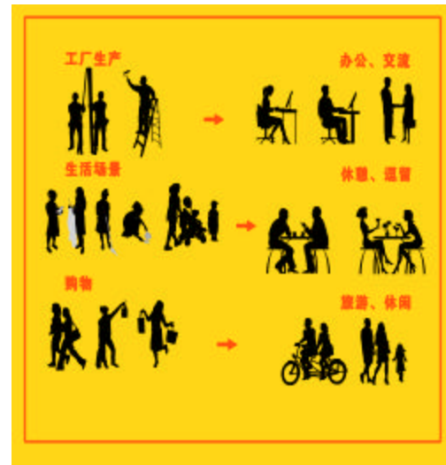
Fig. 1: Comparison diagram of the function of heterogeneous space before transformations

Convergence of space function: Along with the second transformation of heterogeneous space, the convergence of design method and space function is usually the most important issue for designers to think. How to melt the