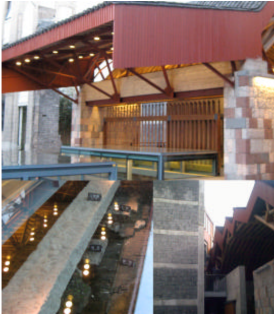
Fig. 3: Southern song imperial street site museum in Hangzhou

layout for the large blocks in the factory space. Beijing “798 Creative Park” divides a typical Bauhaus industrial buildings into several creative units with different sizes and also designs some small-scale shared space in each creative gathering group. Thus each block can have its relatively independent area for activities and exchanges which enlarges the small-scale space for stay and communication and also increases the spontaneous activities for the people in the park. Hangzhou Southern Song Imperial Street is a typical renovation project of historic district. On the convergence of space function, besides the reservation of architectural form and historical culture sites with historic features in each block, the public site museum that was reconstructed from cultural relics as well as the natural transition of space function makes the treasures awake from their long sleeping and shine new splendour in the new era (Fig. 3). Museums of Chinese knives, scissors, swords, umbrellas and fans are successful examples of the transformation of space function which protect and develop traditional Chinese folk culture.