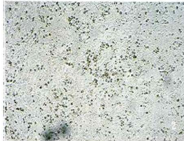
Fig. 2: Formation of rounding cells on vero cell monolayer layer following infection by IBDV

started to adapt on vero cell line and their infectivity to vero cells were low. The P1 viruses were more virulent to vero cells. During second passage, some changes of vero cell monolayer began to develop after 72 h of incubation following infection. Monolayer showed rounding of infected cells. Nevertheless, complete CPEs of IBDV on vero cells were not found at this passage. During third passage, CPE was rapid and consistent. Following 144 h of infection, rounding of infected cells and aggregation of rounding cells were observed.