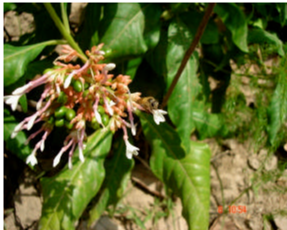
Plate 4: A. mellifera visiting the flower of sarpagandha ( R. serpentina )

These included: Papilio demoleus , Papilio polytes , Danaus aglea creamer , Pieris brassicae , Danaus chrysippus , Eurema hecabe , Pedias skipper and cabbage butterfly. Some hymenopterous insects visiting sarpagandha flowers, on the other hand, intentionally gathered both pollen and nectar in each foraging attempt. These were voluntary pollen gatherers and were designated as pollinators. Among the hymenopterous insects, Megachile bicolor , Megachile sp., Mellisodes sp., Xylocopa fenestrata , Xylocopa pubescens and Xylocopa sp. adopted this type of foraging mode and hence acted as pollinators of sarpagandha (Plate 5-9).