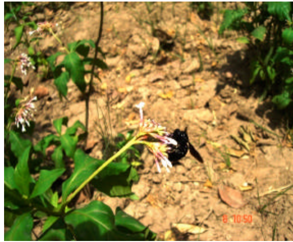
Plate 5: Xylocopa fenestrata visiting the flower of sarpagandha ( R. serpentina )