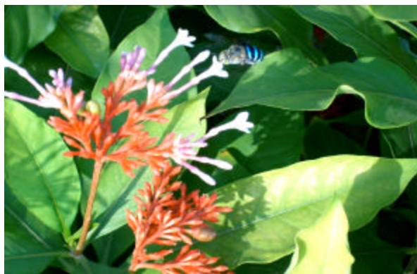
Plate 9: Mellisodes sp. visiting the flower of sarpagandha ( R. serpentina )