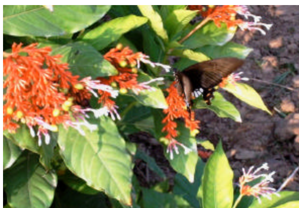
Plate 8: Papilio polytes visiting the flower of sarpagandha ( R. serpentina )