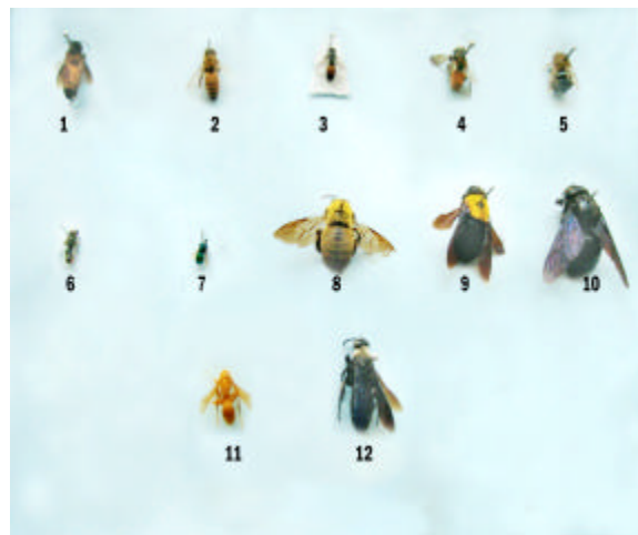
Plate 1: Hymenopterous insect visitors of sarpagandha ( R. serpentina )

Among hymenopterous visitors, three species belonged to the family Apidae i.e., Apis dorsata , A. mellifera and A. florea (Plate 1; 1-3), five species belonged to family Anthophoridae i.e., Mellisodes sp., Pithitis smargdula , Xylocopa fenestrata , Xylocopa pubescens and Xylocopa sp. (Plate 1; 5,7, 8-10, 12 ( 8 and 9 are X. pubescens male and female, respectively), two species belonged to the family Megachilidae i.e., Megachile bicolor and Megachile sp. (Plate 1; 4, 6) and one species belonged to the family Vespidae i.e., Polistes hebraeus (Plate 1; 11). Among lepidopterous visitors, two species belonged to the family Papilionidae i.e., Papilio demoleus and Papilio polytes (Plate 2; 1, 3), two species belonged to the family Danaiidae i.e.,