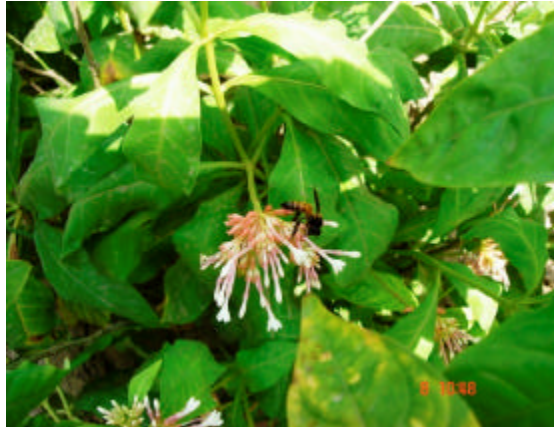
Plate 3: A. dorsata visiting the flower of sarpagandha ( R. serpentina )