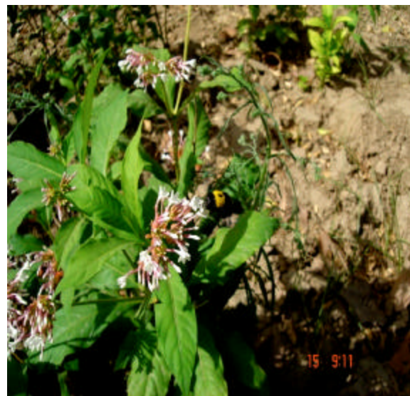
Plate 6: Xylocopa pubescens visiting the flower of sarpagandha ( R. serpentina )

increased gradually and peaks were observed during peak flowering period, when the crop was in full bloom. The number of visitors then decreased gradually and drastically and these were very low at the time of cessation of flowering. In the beginning and at the end of the flowering, the numbers of insect visitors were significantly lower than those at the time of peak flowering. Differences in abundance among the insect species as well as the days were significant. At six observation hours (i.e., 0700, 0900, 1100, 1300, 1500, 1700 h) the number of different insect visitors i.e., Papilio demoleus , Mellisodes sp., Xylocopa fenestrata , Megachile sp., Pieris brassicae and others were 20.96, 16.08, 11.87, 4.98, 6.94 and 3.95 insects/m/min, respectively (Table 3). The peak numbers of insects were observed at 1100 and 1300 h which were significantly higher than those at all other observational hours. However, Xylocopa fenestrata , showed bimodal