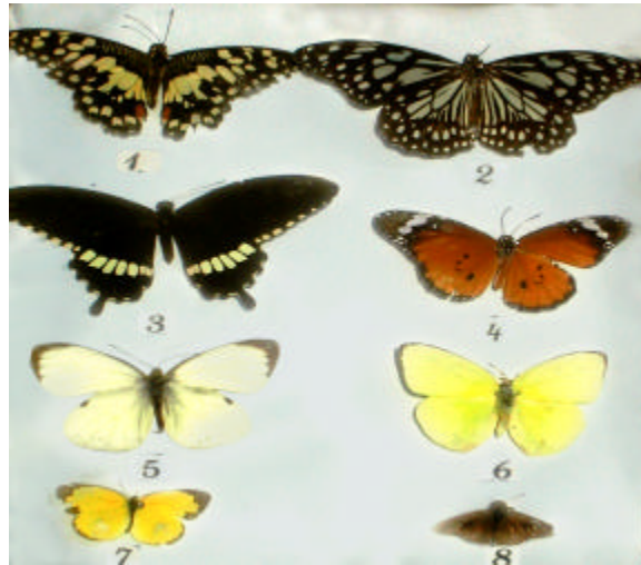
Plate 2: Lepidopterous insect visitors of sarpagandha ( R. serpentina )

Danais chrysippus and Danais aglea creamer (Plate 2; 2, 4), three species belonged to the family Pieridae i.e., Pieris brassicae , cabbage butterfly and Eurema hecabe (Plate 2; 5-7) and one species belonged to the family Hesperidae i.e., Pelopidas mathius (Plate 2; 8).