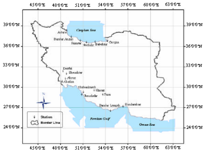
Fig 1: Geographical location of the precipitation stations in Southwestern and Northern parts of Iran

Iran has arid or semiarid climates mostly characterized by low rainfall and high potential evapotranspiration. The annual precipitation varies from about 1800 mm over the Western Caspian Sea coast and Western highlands to less than 50 mm over the uninhabitable Eastern deserts (Fig. 1). The average annual precipitation over the country was estimated to be around 250 mm, occurring mostly from October to March (Eslamian et al. , 2009 a). Annual precipitation is lower in the Eastern half of Iran compared with the Western half. In Northern Iran, the Caspian Sea shores have an annual precipitation of about 500 mm in the East to 1800 mm in the west. In contrast to other parts of the country, the amount of spring and Summer rainfalls are considerable in this region (Amiri and Eslamian, 2009).