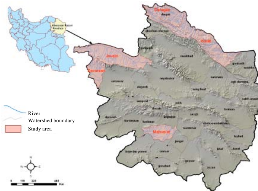
Fig. 2: Five catchments in Khorasan Razavi province of Iran