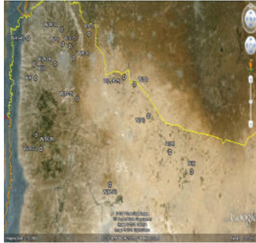
Fig. 1: The location of the wells