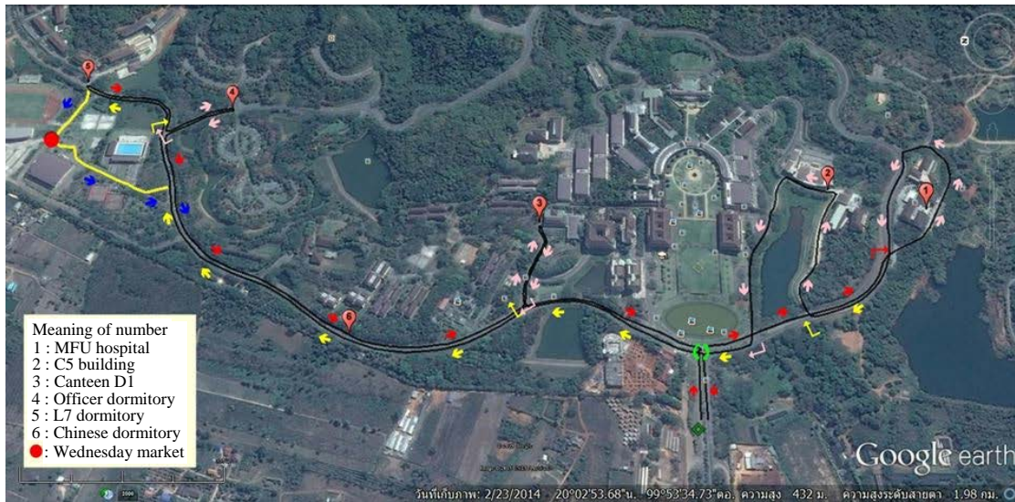
Fig. 4: Google Earth view of Mae Fah Luang University proposed waste collection points and transportation route