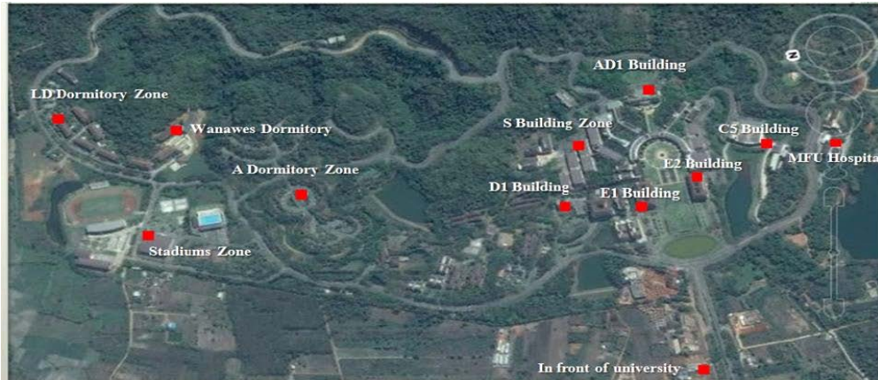
Fig. 1: Google Earth view of Mae Fah Luang University 12 existing waste collection points