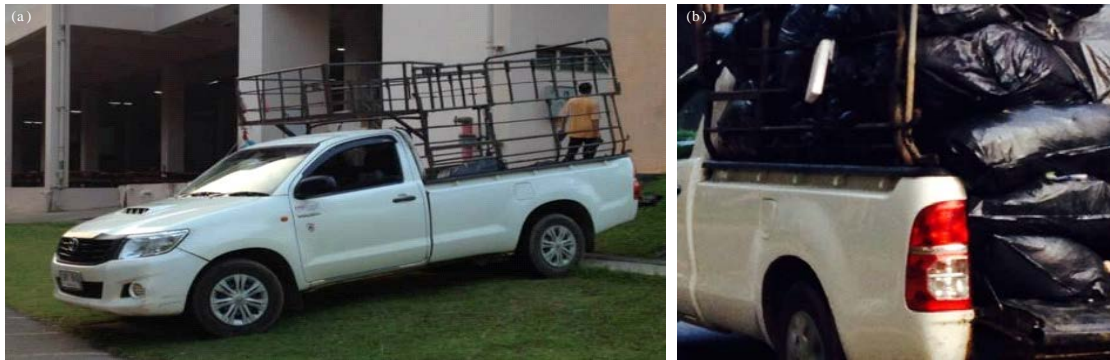
Fig. 2(a-b): Mae Fah Luang University waste collection vehicle

collection pick up time was in the range of 34-365 sec/collection point which resulted in 17 min of total waste collection pick up time per round and totaling up to 41 min in a day.