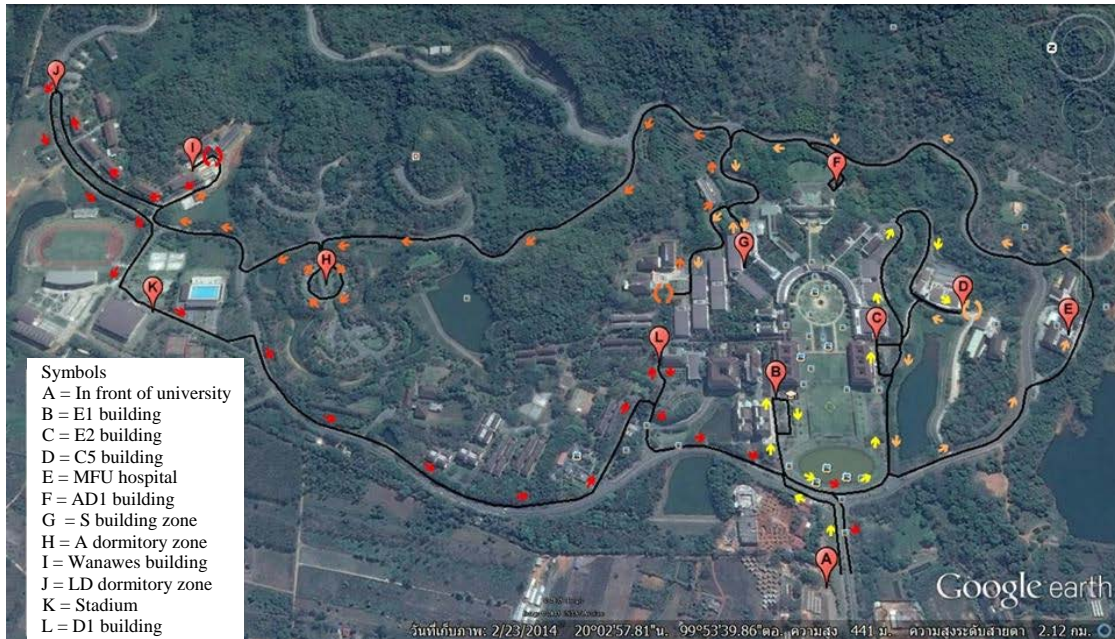
Fig. 3: Google Earth view of Mae Fah Luang University existing waste transportation route

walk some distance to the collection point from where their cars were parked. Some sites were near public areas with possibility of nuisance and loss of aesthetics. As for design, it was found that 60% of the waste collection points did not meet standards (Tchobanoglous et al. , 1993) such as sign, no vector control, no roof and no fence etc.