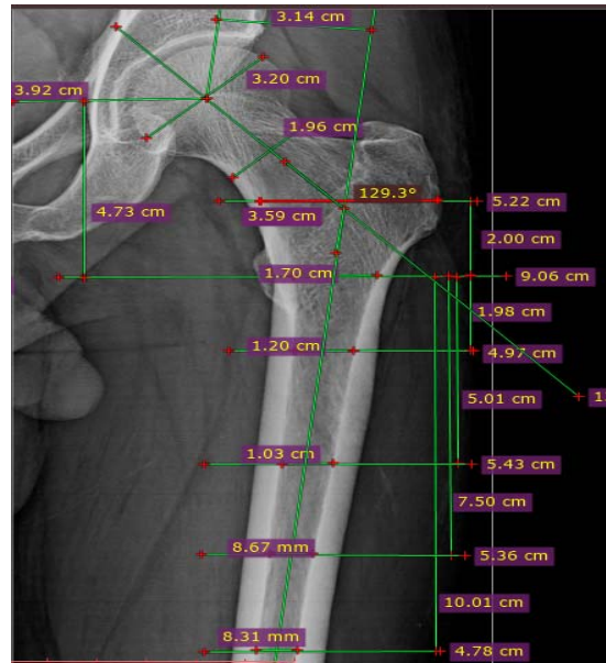
Fig. 2: Measured value of anatomical parameter on femur