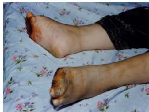
Fig. 2: Extremities gangrene