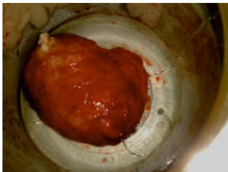
Fig. 2: Intra mural myoma

to evaluate any bleeding. Post operative, we found uterine atony, profuse bleeding at the drainage through the peritoneum and marked changes in hemoglobin value. Then we performed postpartum hemorrhage therapy by using 2 intravenous lines with 20 IU oxytocin on 500 cc ringer lactate and blood transfusion. The atony was then managed and the patient was stable. The post-operative treatment was remarkable and the woman was discharged from the hospital 4 days after the operation. The histology report showed sections of interlacing bundles of smooth muscles with no evidence of malignancy. The 6 weeks post-operative visit was unremarkable.