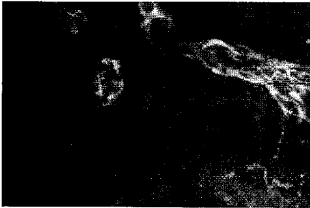
Fig. 1: Fluorescent adrenergic nerve fibres are visible in periarterial location as a longitudinal nerves and forming the adventitial nervous plexus in wall of detaching arterial branch