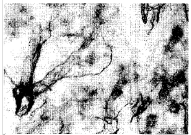
Fig. 5: Thick nerve bundles in periarterial course and fine adventitial plexus of AChE-positive nerve fibres associated with the splenic artery (A)