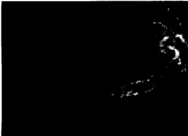
Fig. 2: Rich adventitial nervous plexus of the central artery and detaching nerve fibres into the PALS encircling the marginal zone. Numerous nerve fibres are presented in the red pulp