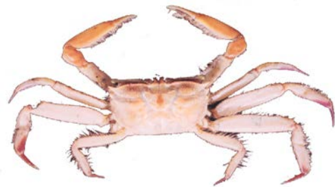
Macrophthalmus (Ventius) latreillei (Desmarest, 1825).

Description: The carapace (Fig. 1A) is much broader than long it is 2.1 cm, long including rostrum and 3.1 cm broad. Tesch (1915 : 183) stated that in this species the shape of the carapace vary considerably in some cases being nearly equilateral, in others much more elongated transversely. The dorsal surface is provided with fine granules and fine setae all over, the regions are well defined with grooves, the granules are in definite pattern and pose bilateral symmetry. The lateral margins are parallel and converge posteriorly. These margins are fringed with thick long plumose