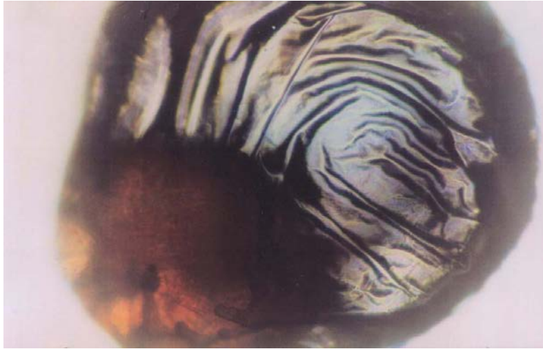
Fig. 1: The Holly phrase of “Lailaha Illa Allah” was found sculpturing on the chorion of Spodoptera littoralis eggs (newly laid)