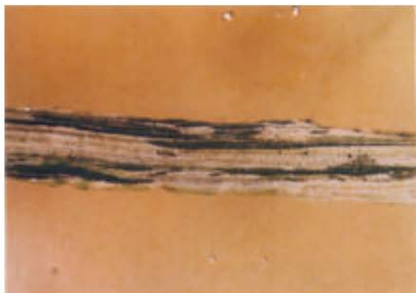
Fig. 7: Flag smut