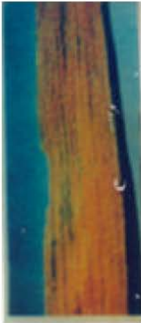
Fig. 2: Yellow or stripe rust