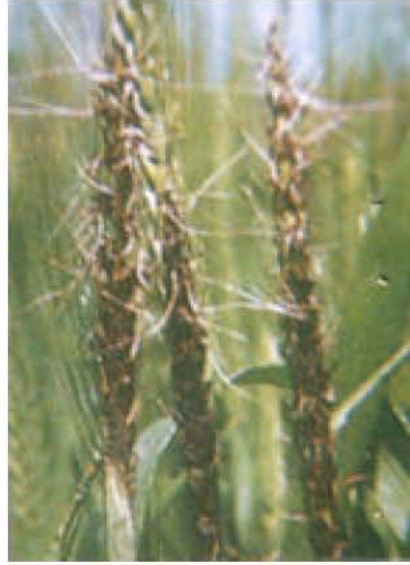
Fig. 4: Loose smut