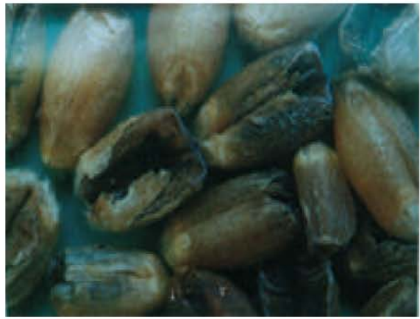
Fig. 5: Karnal bunt