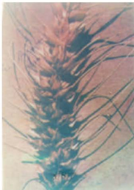
Fig. 9: Ear cockle

northern areas of Pakistan. Pustules developed on leaves, stem, stem sheath and ears were elongated and dark reddish brown in colour. A temperature of 25°C or above favoured the rapid spread of the stem rust disease. The pustules later turned black (Fig. 1).