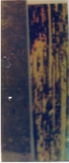
Fig. 1: Black or stem rust