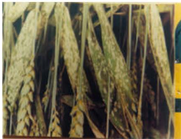
Fig. 8: Powdery mildew