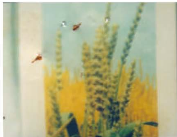
Fig. 6: Complete bunt