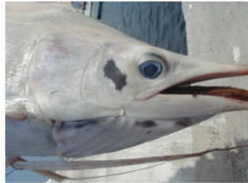
Fig. 4: Head dark areas

predation risk, specially during its first stages of growth, and might disturb communication in those species that use colours for visual recognition.