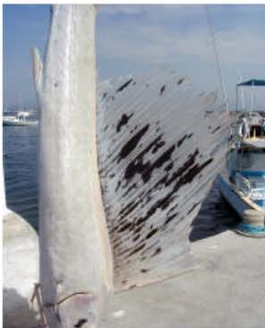
Fig. 3: Dark dorsal fin areas