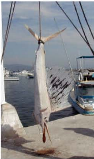
Fig. 2: Albino sailfish Istiophorus platypterus . (conserved by taxidermy in the Manzanillo Fishing club A.C. Colima State, Mexico.)