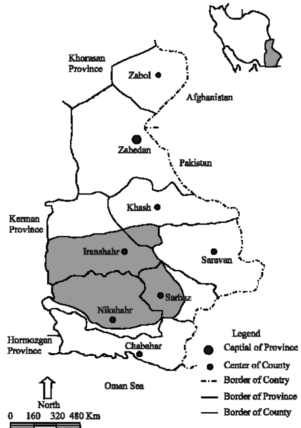
Fig. 5: Dispersion of fire ant P. sennaarensis (Hym.: Formicidae) (highlighted area in map) in Sistan and Baluchistan province, southeast of Iran, 2004

Geographical distribution of the ants has shown in Fig. 5 (highlighted area). It is obvious that the ants is occurred in Iranshahr, Sarbaz and Nikshahr districts but have not revealed in Chabahar Port and other part of the province, which placed in neighboring of Afghanistan and Pakistan.