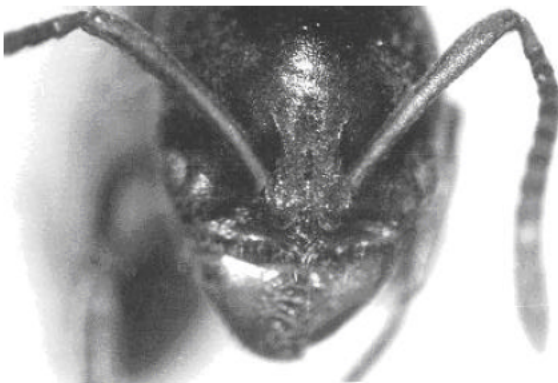
Fig. 3: Frontal lobe of P. sennaarensis (Hym.: Formicidae). Photography: Museum of Medical Entomology, School of Public Health, Tehran University of Medical Sciences, May 2003, original 400X