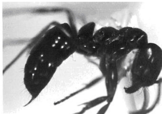
Fig. 1: Fire ant of Iran, Pachycondyla senaarensis (Hym.: Formicidae), Photography: Museum of Medical Entomology, Public Health School of Tehran University of Medical Sciences, May 2003, original 250X

Pretarsal claws are simple, without teeth on the inner curvature behind the apical point. The petiole is consisting of 1 segment (abdominal pedicel), which is without an anterior peduncle and narrowly attached to the first gastral segment. First gastral segment has separated from the second only by a narrow girdling. Hypopygium with its lateral margins is smooth and without spines. Sting is developed and functional at gastral apex (Fig. 1).