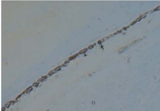
Fig. 4: Photomicrograph showing the marginal zone rat embryo at E 18 . Staining is observed in a group of highly active cells. There are two kinds of NOS-positive cells: big chief cells in the middle part of the marginal zone with long processes having the characteristics of Cajal-Retzius cells and small round cells in the lateral portion. Cryostat section