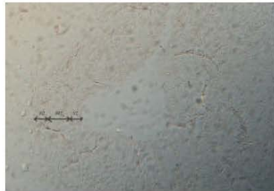
Fig. 2: Frontal section through the optic rat embryo at E 14 optic vesicle Viewed at higher magnification. At this stage, the diencephalic vesicle continues to grow and its thickness increases. The marginal zone has been also thicker and because of growth of the ventricular zone, the intermediate zone is more prominent. Cryostat section

In the late stage, the most notable feature was a decrease in the histochemical reaction of the marginal zone. Horizontally coursing NADPH-d histochemical activity fibers could also be observed in the marginal zone. Also NADPH-d reactivity was observed in