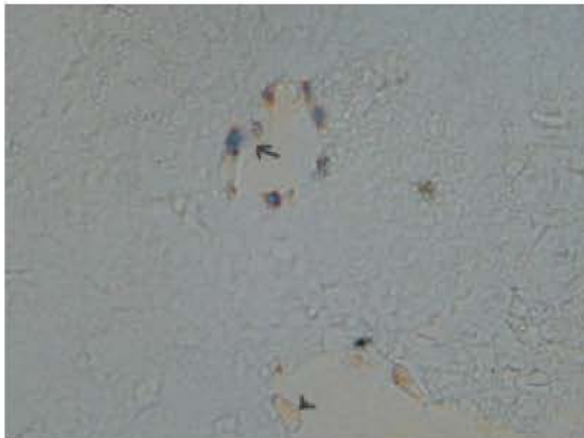
Fig. 5: NADPH-d histochemistry in the rat cells embryo at E 19 . Here are also shown the cells without reaction. Cryostat section

endothelial cells lining the larger blood vessels, but it was not present in endothelial cells of sinusoidal capillaries or the small vessels (Fig. 5).