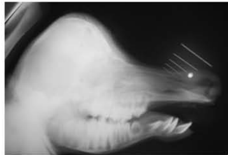
Fig. 1: Lateral view of head male water buffalo calf. Brachygnathia is obvious

Gross examination revealed normally proportioned maxillary features and brachygnathia inferior (Fig. 1).