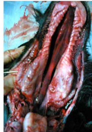
Fig. 2: Median cleft palate is obvious both in hard and soft palate

Closure of the mouth left exposed approximately 4 cm of the upper mouth. The large cleft in the palate (Fig. 2, 3)