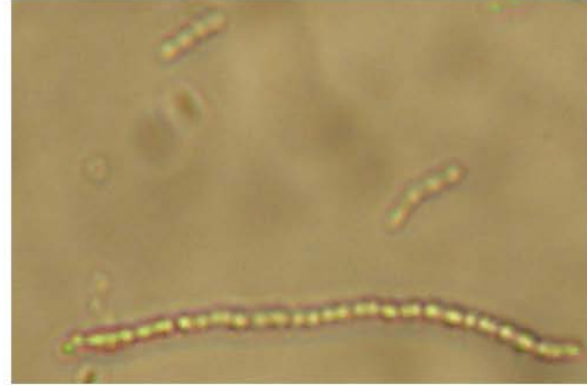
Fig. 1: Phase-contrast micrographs of tannic acid degrading bacterium (Strain AB)

Growth, physiology and metabolic properties: Strain AB was a mesophilic, facultatively anaerobic, chemo-organotrophic bacterium. The optimum growth temperature for the strain was 37°C; growth was observed between 20 and 40°C; no growth occurred at 50°C. The optimum pH for growth was pH 8 and the pH range for