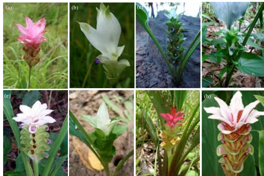
Fig. 2(a-h): Ornamental Curcuma species found in this study (a and b) Curcuma alismatifolia (c and d), Curcuma parviflora (e and f), Curcuma gracillima , (g), Curcuma angustifolia (h), Curcuma rhabdota

National Parks in Northeastern Thailand (Table 2, Fig. 1-2). Four species were found in Sai Thong NP and Phu Phan NP, including C. angustifolia , C. alismatifolia , C. gracillima and C. parviflora . Three species