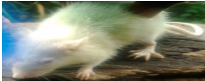
Fig. 1: A rat representing the control group

The effect of the repeated administration of the herbal bitters on serum concentrations of interleukin-2 (IL-2), interleukin-6 (IL-6), tumour necrosis factor alpha (TNF- \alpha ), uric acid and liver reduced glutathione and