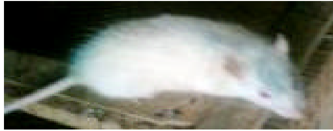
Fig. 2: A rat representing the 0.308 mL kg -1 b.wt. group