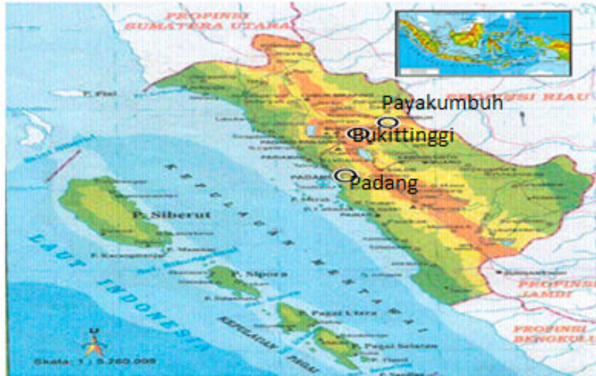
Fig. 1: Study area

Padang, which lies in the ( 00^{\circ} 53' 666'' - 00^{\circ} 53' 786'' SL and 100^{\circ} 21' 999'' and 100^{\circ} 2' 968'' LE), elevation was in 18 m above the sea level (asl.). Bukittinggi is located on the site ( 00^{\circ} 18' 899'' - 00^{\circ} 17' 898'' SL and 100^{\circ} 23' 61'' - 100^{\circ} 22' 62'' LE), elevation was in 939 m above sea level. Payakumbuh lies in the ( 00^{\circ} 12' 935'' - 00^{\circ} 12' 935'' LS and 100^{\circ} 37' 901'' - 100^{\circ} 37' 899'' LE), elevation was in 534 m above sea level. Rainfall, temperature and humidity data were obtained from the Meteorology and Geophysics Agency (MBKG) Minangkabau Airport, 2012 and Sicincin Climatology Station, West Sumatra, 2012 (Fig. 1).