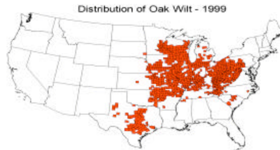
Fig. 1: Distribution of oak wilt incidence by county in the United States as of December 1999. Shaded counties have confirmed cases of oak wilt

Epidemiology and future expansion: The geographical expansion of oak wilt has been slow (often less than 17 m/year) in mixed interior hardwood stands because highly diverse forests tend to create space barriers due to the intermixing of nonhosts that hinder root transmission of the pathogen [7] . This may also be attributed to the poor localized distribution of the pathogen by inefficient nitidulid beetle vectors and the low incidence of random root grafting within mixed hardwood stands. By contrast, movement can be quite rapid (up to 45 m/year) in pure stands containing a single oak species, such as is common in the large stands of live oaks in central Texas [29] .