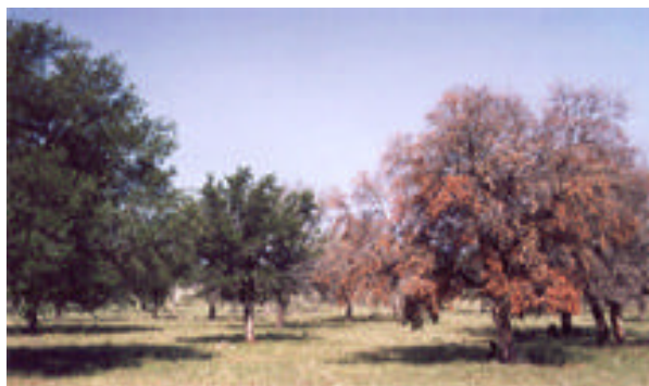
Fig. 2: Plateau live oak ( Quercus fusiformis ) trees in central Texas along the advancing edge of an oak wilt infection center. Healthy green trees (left side) are compared with symptomatic dying trees (right side)

The leaves on diseased Texas live oaks often develop foliar symptoms rapidly [24] . Leaf symptoms are produced primarily in the spring and fall. Leaves develop chlorotic (yellow) veins that eventually turn necrotic (brown), a diagnostic symptom known as veinal necrosis. Dead and dying trees are often seen near the expanding edge of oak wilt infection centers (Fig. 2). Defoliation may be rapid and dead leaves with brown veins often can be found under the tree for months after defoliation. The tree crown progressively thins out until the entire tree is defoliated. Leaves also may exhibit other patterns of chlorosis and necrosis, such as interveinal chlorosis, marginal scorch, or tip burn, but these symptoms are less common and unreliable for recognizing oak wilt in live oaks.