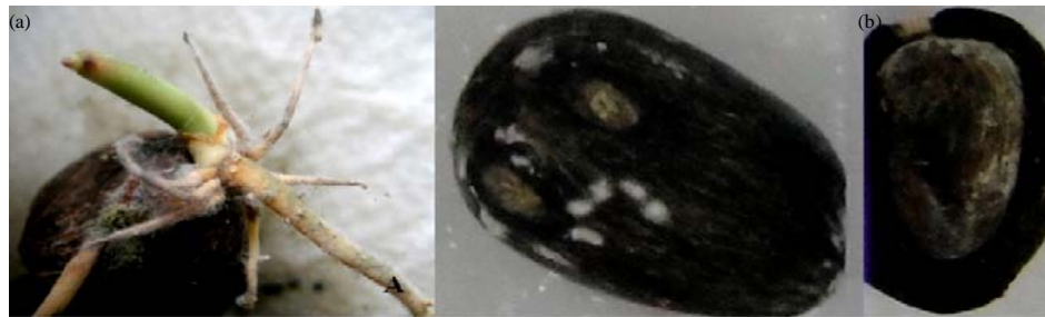
Fig. 2(a-b): Seed diseases of oil palm, (a) Brown germ and (b) Seed rot