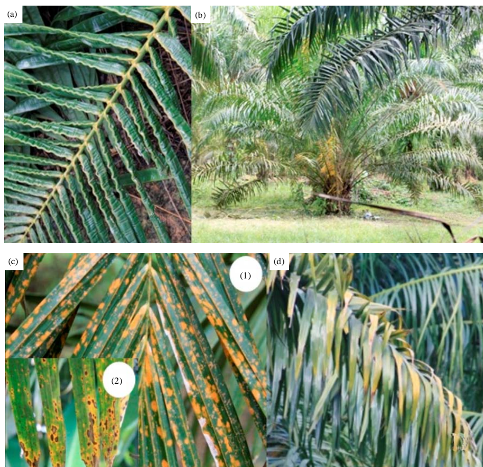
Fig. 5(a-d): Mineral deficiencies of oil palm, (a) Boron deficiency; wrinkled leaf, (b) Nitrogen deficiency, (c) Potassium deficiency, (1) Confluent orange spotting, (2) Chlorotic or necrotic spots on older fronds and (d) Magnesium deficiency

Nitrogen: Symptoms may appear on either young or old fronds, with the entire plant often affected. Deficient fronds first become pale green in color, changing to pale or bright yellow as the chlorosis becomes more severe. In advanced cases of deficiency, the apocome also becomes deep orange in color and ultimately the entire petiole and rachis become bright orange in appearance (Fig. 5b).