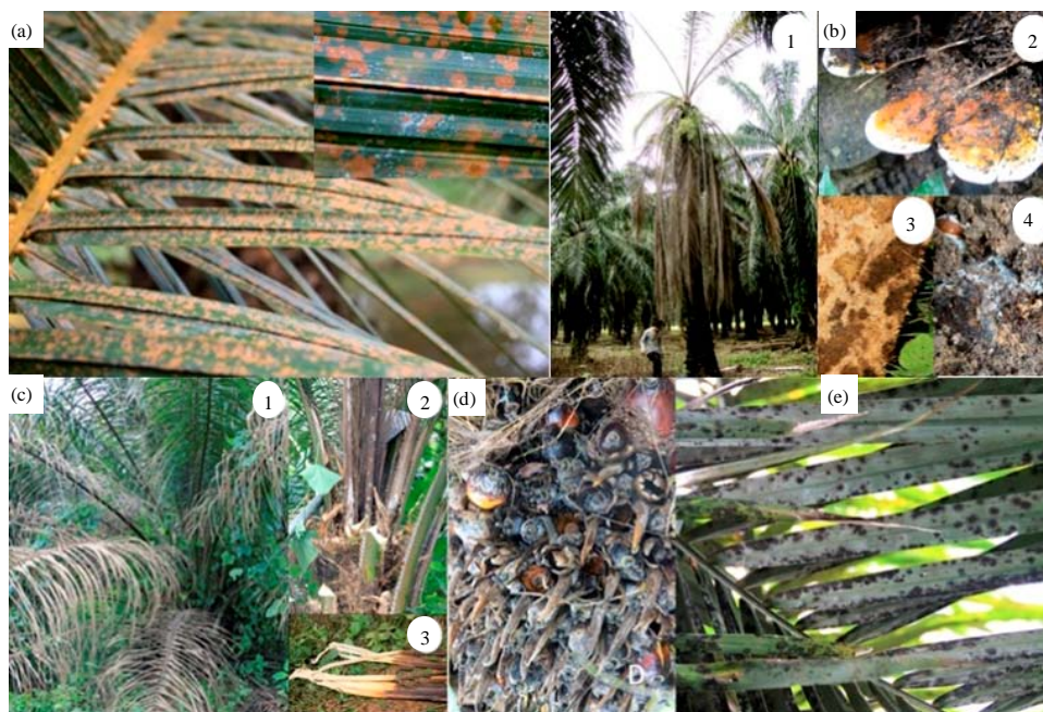
Fig. 4(a-e): Field diseases of oil palm, (a) Algal leaf spot, (b) Basal stem rot (1) The oldest fronds have died and collapsed, (2) Fruiting body of Ganoderma boninense , (3) The beginning of infected tissues, (4) Mycelia of Ganoderma boninense in diseased tissues, (c) Spear rot of oil palm (1,2) The spear leaf and next youngest leaves discolored or collapsed, (3) Yellowing and rotting of spear leaf, (d) Bunch end rot and (e) Sooty mold on the pinnate

Basal stem rot: This disease is caused by Ganoderma mushroom that attacks the palm at the stem base. The fungus may be observed as a whitish skin-like layer on the inner surfaces of the exodermises; cortical tissue becomes brown. The disease causes dry rot of internal tissues that severely restricts the supply of water and