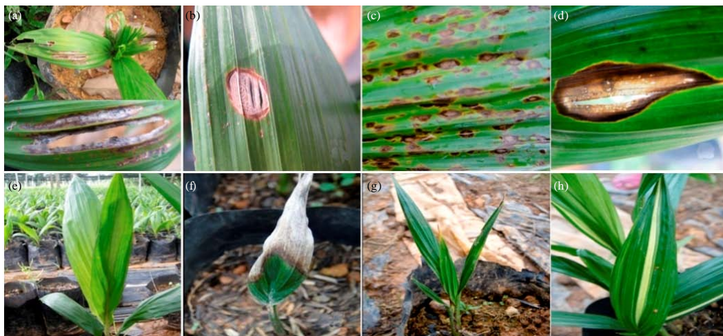
Fig. 3(a-h): Nursery diseases and disorders of oil palm, (a) Anthracnose, (b) Cercospora leaf spot, (c) Curvularia leaf spot, (d) Pestalotiopsis leaf blight, (e-h) Genetically abnormal seedlings, (e) Bifurcate, (f) Fertilizer burn at leaf tips, (g) Narrow leaf (grass leaf) and (h) White stripe