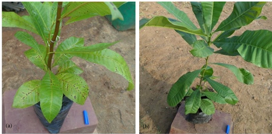
Fig. 3(a-b): Comparison of inoculated and non-inoculated cashew seedlings. (a) Necrotic black spot of Colletotrichum sp. on leaves inoculated and (b) Control plant leaves with any symptom

Column diagrams with the same letter are not significantly different using Newman-Keuls test. Vertical bars represent the Standard Error (SE)