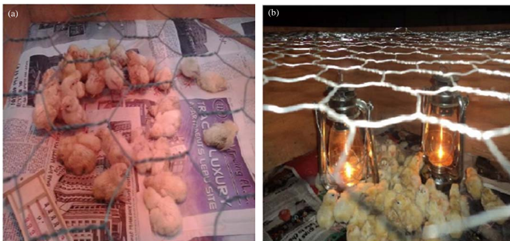
Fig. 3(a-b): Day old chicks after transformed in to their Solomon brooder cage run

The survival rate of the hatched chick for one week for broody hen incubation technique (50.7%) was significantly lower ( p<0.01 ) than sand incubation technique (98.1%) as shown in Table 1. Among the indigenous local fowls, percentage of the chicks hatched died before they reached cockerel or pullet stage and annually percentage of the entire flock die, before the keeper could reap any benefits in terms of meat or eggs. The difference in survival rate between the two incubation techniques were due to the difference in the management practice. The sand incubated chicks were kept in hover, which they were supplemented by kerosene lamp shown a better survival rate whereas, the broody hen are the only source of heat for the chicks (Fig. 3).