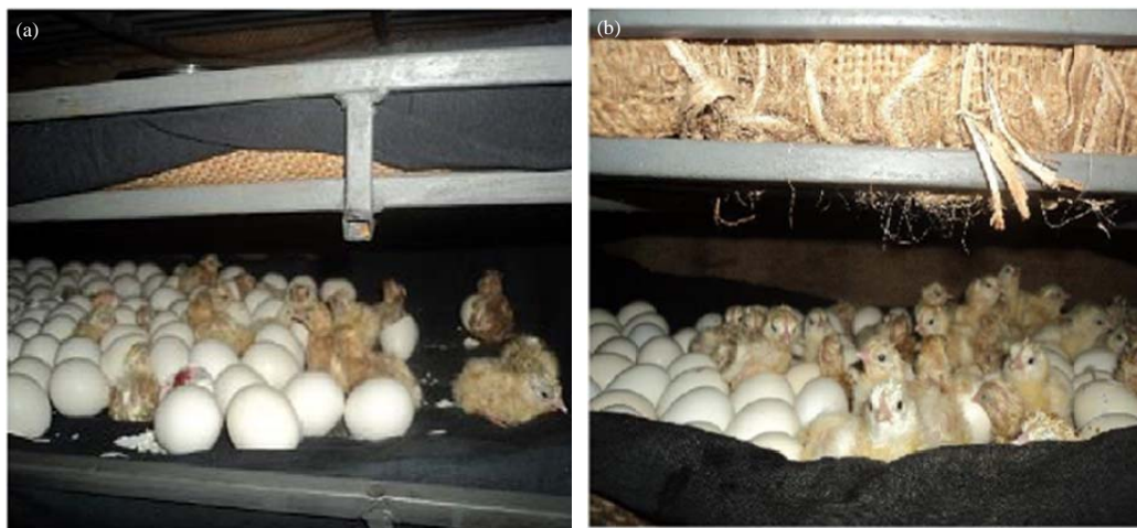
Fig. 2(a-b): Chicks that hatched on sand incubator

Values indicate Mean±SE, values within rows without superscript in common differ at p < 0.05 , ***Significant differences at 5% ( p < 0.05 ) and 1% ( p < 0.01 ) level of significant, respectively, NS: Non-significant, DOC: Day old chick