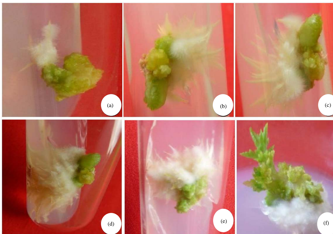
Fig. 3(a-f): Rhizogenesis from hypocotyl and cotyledon explant of Citrullus colocynthis (L.) Schrad, (a) Initiation of hairy roots from hypo cotyledon derived callus on MS+1.0 mg L -1 2,4-D+1.0 mg L -1 IBA, (b) Formation of secondary roots from hypocotyledon explant on MS+2.0 mg L -1 2,4-D+1.5 mg L -1 IBA, (c) Cluster of hairy roots and fibrous roots developed from hypocotyledon explant on MS+2.0 mg L -1 NAA+0.5 mg L -1 IAA, (d) Induction of massive hairy roots developed from cotyledon derived callus culture on MS+1.0 mg L -1 IAA and 1.0 mg L -1 IBA and (e) Induced multiple roots and shoots from cotyledon derived callus subculture on MS+2.0 mg L -1 IAA+1.0 mg L -1 IBA+1.5 mg L -1 BAP

Rhizogenesis from hypocotyl explant cultures: Rooting was occurred directly from explant before callus is completely induced on MS medium with 2.0 mg L -1 2,4-D and 1.5 mg L -1 IBA (Fig. 3b). Hypocotyl explants cultured on MS medium with 2.0 mg L -1 NAA produced brown callus (Fig. 3c). After five weeks of culture, brown callus was subcultured on MS medium fortified with 2.0 mg L -1 NAA and 1.0 mg L -1 IBA rhizogenesis occurred (Fig. 3d). Auxins in different combinations induced direct rooting from explants (Table 1 and Fig. 2).