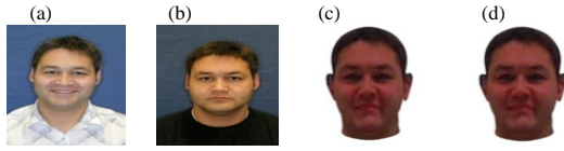
Fig. 1: Use CMU MultiPIE database for expression neutralizations where: a) Gallery image; b) Resulted neutralization expression; c) Resulted the transfer and d) Expression from gallery to probe

expression mechanism. This neutral expression should be determined on a neutral image training group (N). Here, it should be noted that (3DMM) has been fitted on the neutral design of the training kit. We can also calculate expression coefficients \alpha_{exp}^i through this procedure these images can be extracted in this technique, mean expression neutral coefficients are calculated as the mean of all expression coefficients in the neutral training group: