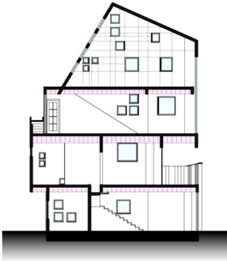
Fig. 10: Nursery room section