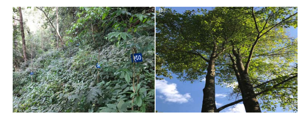
Fig. 2(a-b): Private plantation of Aquilaria malanccensis, (a) Aquilaria malanccensis plantation at worst site and (b) 15-year plantation of Aquilaria malanccensis

Fig. 1: Map of study area