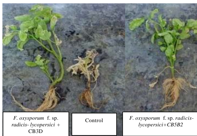
Fig. 2: Improvement of plant growth of one month old tomato plants (cv. Riogrande) with compost bacteria. Control: substrates with Fusarium oxysporum f. sp. radicis-lycopersici