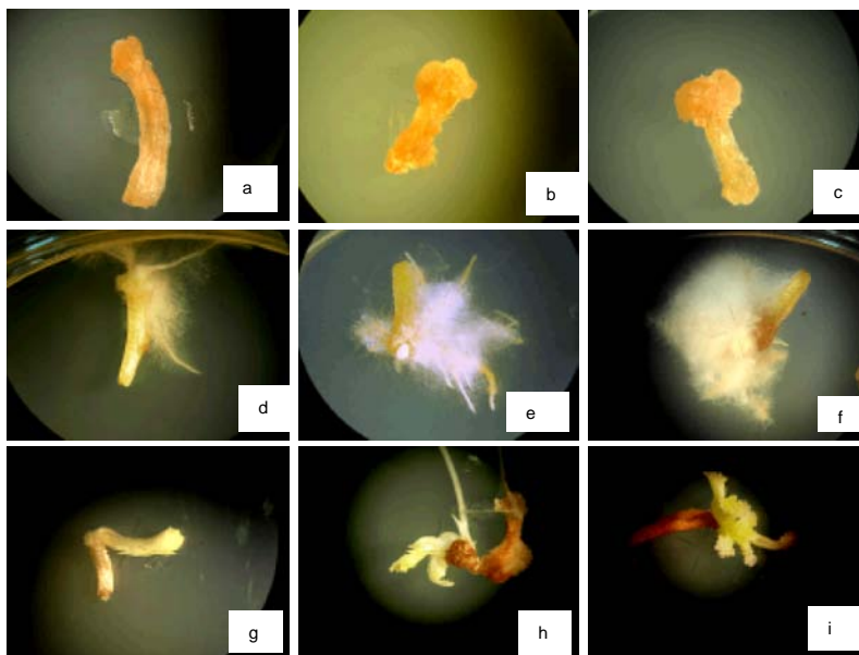
Fig. 1: Effect of oxalic acid on callusing, rooting and shooting of Brassica napus L. Effect of OAA on induction and growth of calli in 0 mM L -1 OAA (a), 0.02 mM L -1 OAA (b), 0.2 mM L -1 OAA (c), the means number of regenerated roots in 0 mM L -1 OAA (d), 0.02 mM L -1 OAA (e), 0.2 mM L -1 OAA (f), the means number of regenerated shoots in 0 mM L -1 OAA (g), 0.02 mM L -1 OAA (h) and 0.2 mM L -1 OAA (i)