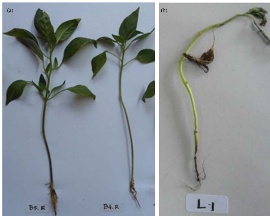
Fig. 1(a-b): Symptom observation in Branang (a) Resistant plant (b) Lembang-1 (very susceptible plant)

*Number with the same letter in this column means not difference statistically with p<0.05, **S: susceptible, VS: Very susceptible, R: Resistant