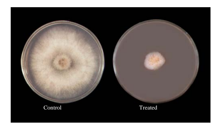
Fig. 2: Antifungal activity of the non-volatile metabolites of Trichoderma against B. fabae

Asian J. Plant Pathol., 10 (3): 21-28, 2016