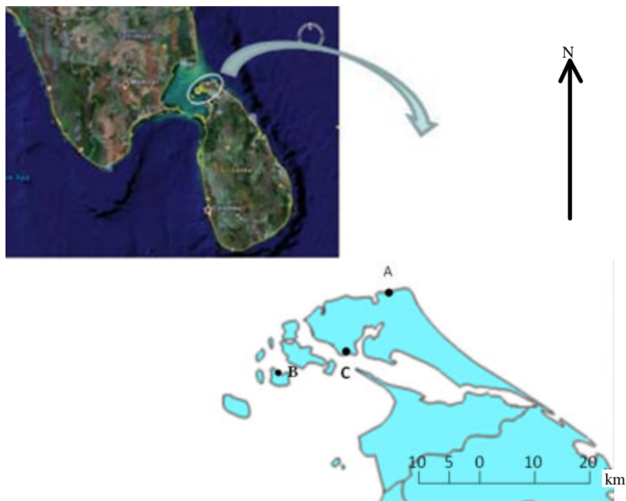
Fig. 1: Sampling sites (A, B and C) of fishes from waters around Jaffna peninsula (A) Point Pedro (B) Delft (C) Passaiyoor