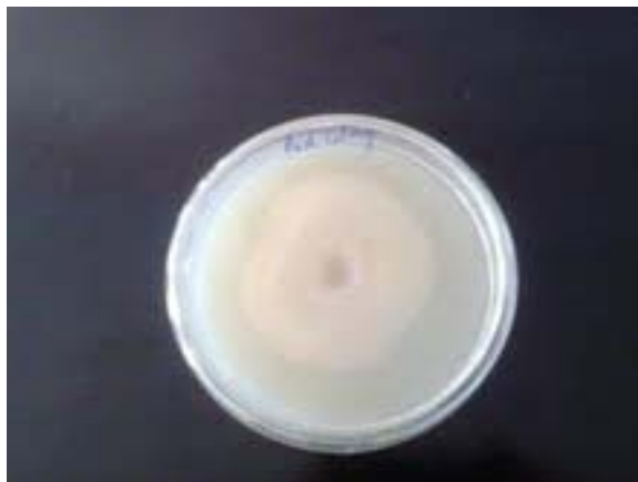
Fig. 1: Screening by using Tweens as substrates, the Tween 20 agar plate showing the zone of precipitation around the well due to the formation of insoluble calcium salts by the released free fatty acids due to the action of the lipase enzyme added to the well, which forms complexes with the calcium salts present in the medium

Sierra (1957) developed a cup plate method for determination of lipase activity using Tween 20 as a substrate (Fig. 1). Salihu et al. (2011) screened different fungal species using Tween 20 as a substrate. The lipase activity in this method can be detected due to occurrence of a zone of clearance and subsequent formation of white precipitate of calcium monolaurate around the colony (Cardenas et al. , 2001). Tween 80 as a lipidic substrate in to the growth medium was used by Schoofs et al. (1997), Akano and Atanda (1990) and Gopinath et al. (2005).