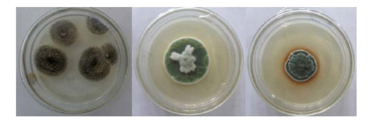
Fig. 2: Revived cultures of fungi

Viability test: Viability test is very important step for the long term preservation, due to cold storage the cells and tissues of culture are damage and affect the regeneration capability, so it very important to check that the preserved cultures are viable are not at regular interval of time. So, fungal cultures are regularly tests for its regeneration capability in every six months, by using modified method of Espinel-Ingroff et al. (2004). Firstly, cultures are placed in room temperature for 10 min then thawing was done. After thawing, the cultures are picked from both the method (Cut and Slant) tube and inoculated into pre-poured PDA plates then incubated at 25°C for 10 days for growth. This viability tests are continuously performed in every 6 month upto 30 months (Fig. 2).