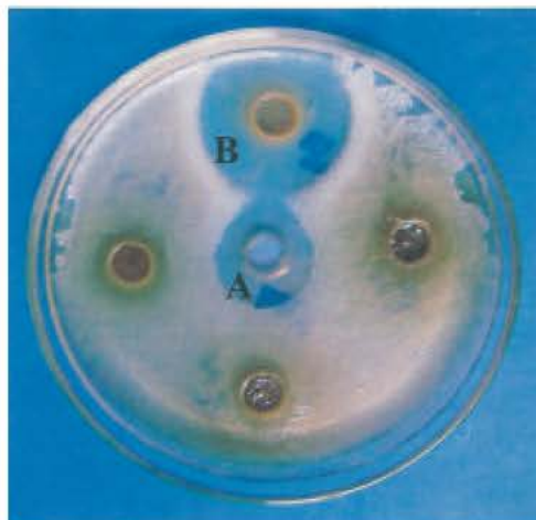
Fig. 1: T. indica ethanol extract showing S. typhi growth inhibition, A = 50% conc.; B = 100% conc