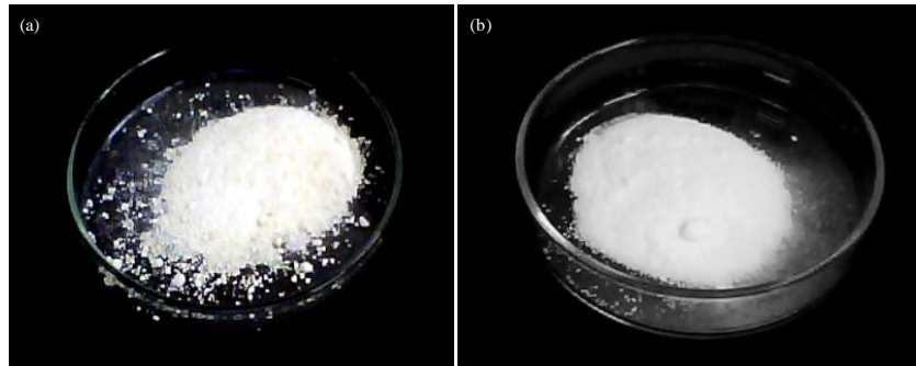
Fig. 1(a-b): (a) Powder of saponin Aloe vera and (b) Powder of sodium lauryl sulphate