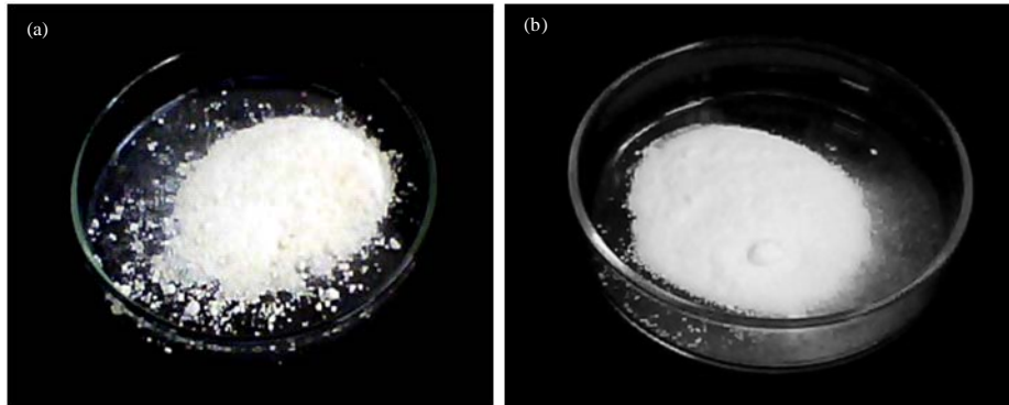
Fig. 1(a-b): (a) Powder of saponin Aloe vera and (b) Powder of sodium lauryl sulphate