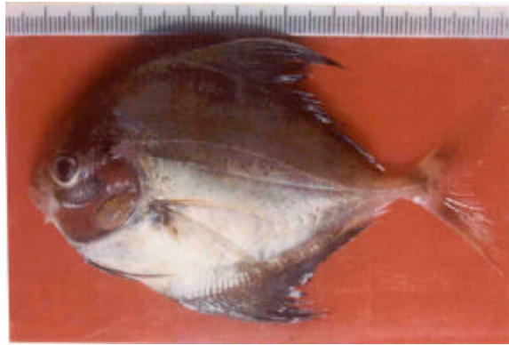
Fig. 3: Male and female J. tartoor in the branchial region of Parastromateus niger

Lesions were never encapsulated by developed granulomas that underlain in the lost epidermis. Lesions appeared to originate in the muscle or overlying subcutaneous tissue and from these they started spreading to the underlying organs.