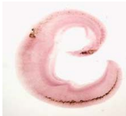
Fig. 7: S. mansoni male worm showing marked stuntedness and poorly developed suckers, recovered at 16 weeks PI (chronic stage) after treatment with ART at 13 weeks PI (x 40)