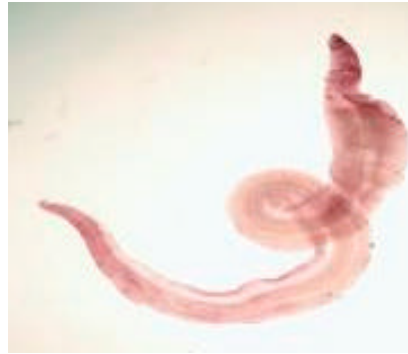
Fig. 4: S. mansoni male worm showing curled or coiled appearance, poorly developed suckers and irregular tegument with absence of tuberculations. It shows absence of testes and empty intestine, recovered at 16 weeks PI after treatment with SOM at 13 weeks PI (x 40)