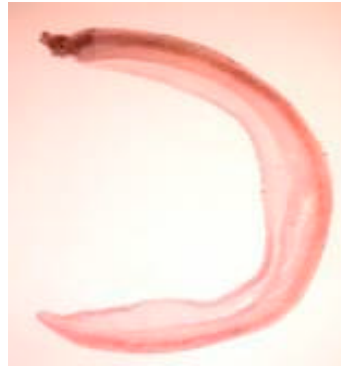
Fig. 3: S. mansoni male worm showing poorly developed suckers, testes and empty intestinal caeca with obviously widening of gynaecophoric canal recovered at 8 weeks PI after treatment with SOM at 5 weeks PI (x 40)

slightly affected testes. The majority of the female recovered worms (Fig. 4, 5) treated with SOM showed elongation, moderately developed suckers, ovaries and intestine. Empty intestines both in female and male worms are also observed, which may be due to the effect of the drug on intestinal musculature, which prevents the worms from feeding. These abnormal morphological findings indicate that SOM used may play a dominant role in the affection of female gonads which coincided with Sher et al. (1986). Our detected morphological changes may be mostly attributed to the interference of the drug with the biochemistry or/and physiology of the worms. They could be also attributed to the inhibitory role of SOM on growth hormone and another inhibitory role on tissue