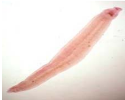
Fig. 6: S. mansoni male worm, showing severe stuntedness with absence of suckers and testes recovered at 16 weeks PI and treated with ART at 13 weeks PI (x 40)