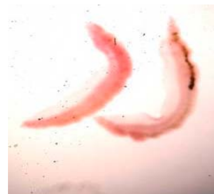
Fig. 8: S. mansoni male worms showing severe stuntedness, absence of suckers and testes, empty intestine and loss of tuberculations recovered at 16 weeks PI (chronic stage) after combined treatment at 13 weeks PI (x 40)