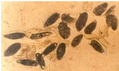
Fig. 10: Tissue bound ova pattern in the small intestine recovered from SOM treated mouse at 5 weeks PI showing large number of dead eggs and broken shells

reductions of the glycogen content of schistosome worms after an intramuscular injection of ART as a single dose ( 300 \text{ mg kg}^{-1} ) for 1 day. The reduction was 50%, increased to 73% after 3 days and was higher in female schistosomes than males suggesting sex-specific drug susceptibility. Upon oral single dose of artemether administration, Utzinger et al. (2003) reported severe and extensive tegumental damage in S. mansoni worms recovered from experimentally infected mice.