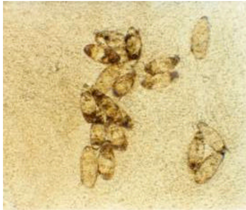
Fig. 9: Tissue bound ova pattern in the small intestine recovered from infected control mouse showing living ova of different developmental stages