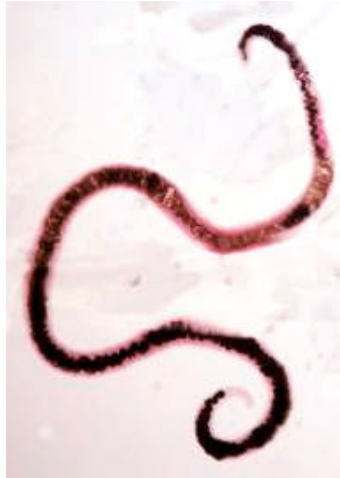
Fig. 2: Normal S. mansoni female worm recovered from infected non treated mice group showing average length, with well developed ovary. It shows pigmented intestine and well developed vitelline follicles (x40)