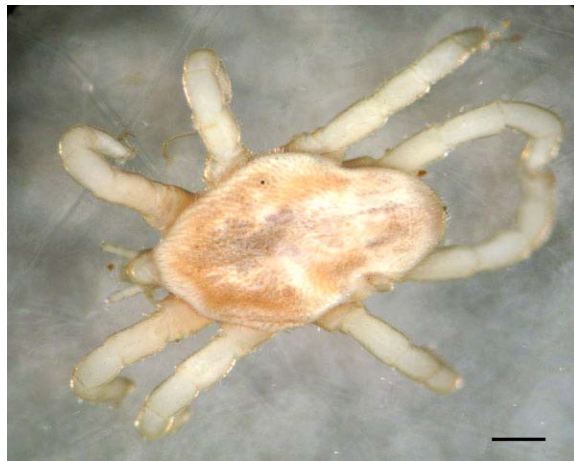
Fig. 2: Nymph of Otobius megnini removed from the horse's ear. Note the Integument covered by hairs and spines. Dorsal view. Bar = 1 cm

Having identified the probable cause of neurological disease, a treatment plan was designed to eliminate any possible remaining ticks and to minimize disease progression. The horse was treated with ivermectin ( 200 \mu\text{g kg}^{-1} \text{PO}^{-1} ) in addition to topical application inside the ear of 3% coumaphos, 2% propoxur and 5% prontalbin (inside the ear/q 12 h). The animal had a last episode of spasm and muscular incoordination in the hind limbs 2 h after treatment but then showed progressive improvement. Clinical signs disappeared completely after 3 days.