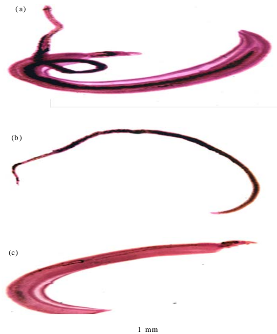
Fig. 2(a-c): Normal untreated Schistosoma mansoni worms (x20) stained with acid carmine stain, (a) Normal male and female Schistosoma mansoni worms in copula, (b) Normal female Schistosoma mansoni worm and (c) Normal male Schistosoma mansoni worm