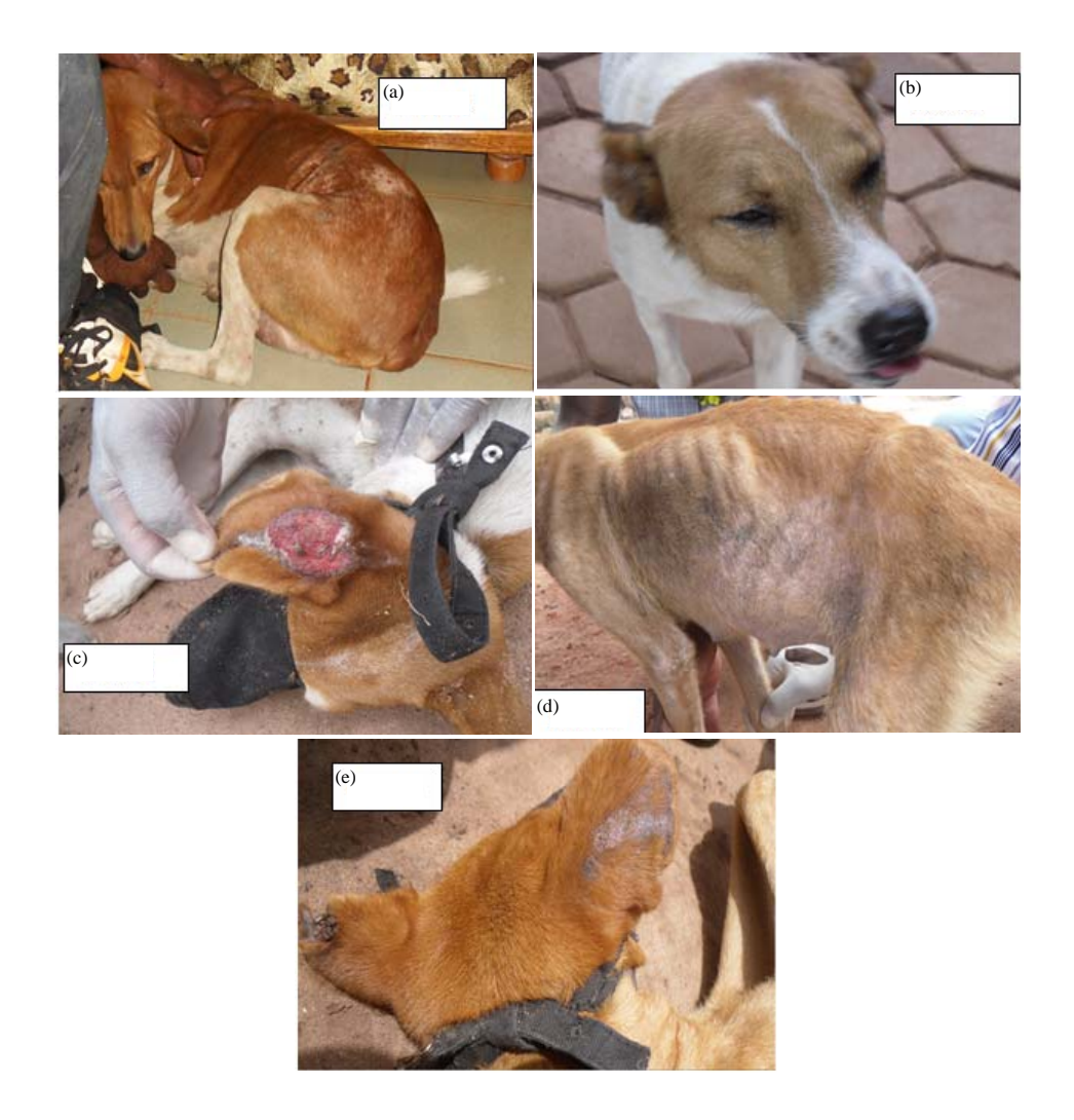
Fig. 2 (a-e): Images of dogs showing different cutaneous lesions and symptoms, (a) Case 1, (b) Case 2, (c) Case 3, (d) Case 4 and (e) Case 5

To confirm the results and to identify the species, PCR analysis was performed on buffy coat samples (all cases) and cutaneous biopsy samples (all cases except Case 1 which did not have open lesions). Biopsy samples were positive for L. infantum in 3 of the seropositive dogs (Case 2, 3 and 4) (Fig. 3). Only one buffy coat sample (Case 3) was positive.