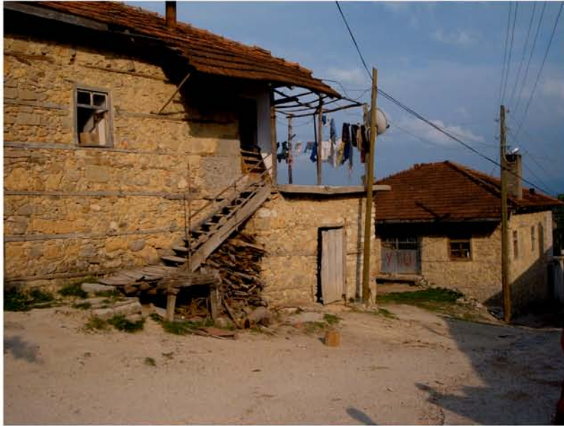
Fig. 2: A typical household from the village