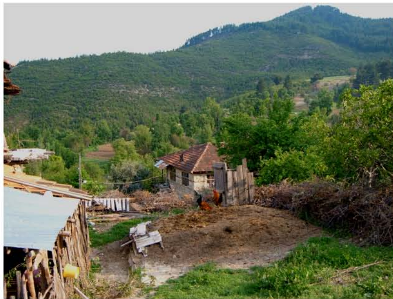
Fig. 3: Artificial manure from livestock and poultry in the village