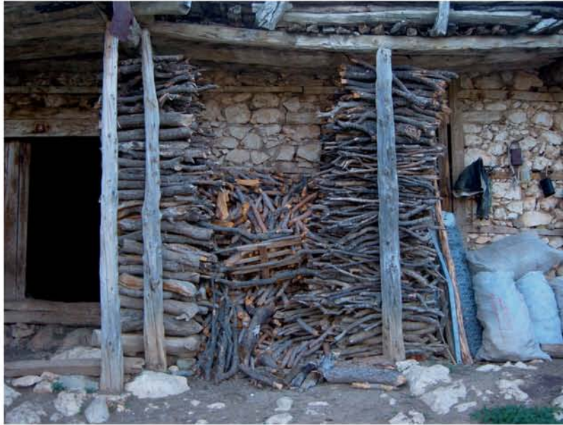
Fig. 4: Fuelwood in a household