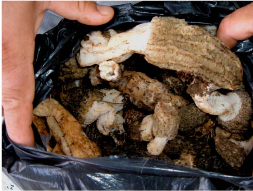
Fig. 5: Wild mushroom from natural forest resources