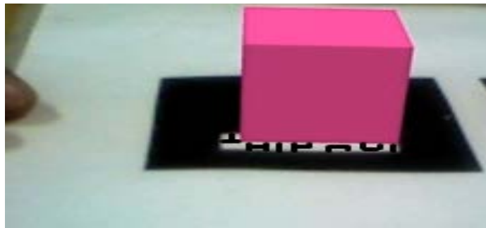
Fig. 2: Appearance of a 3D object when a particular marker (QR code marker 1) is displayed