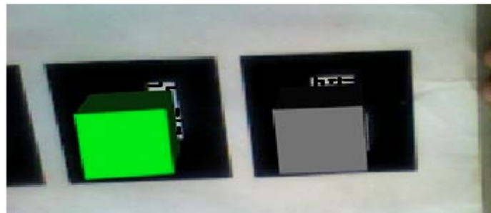
Fig. 3: Two QR code markers are displayed and the corresponding objects of corresponding color appearing on the screen