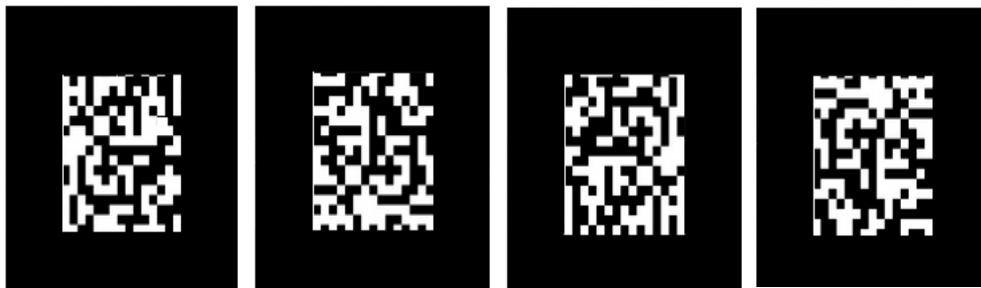
Fig. 1: QR Input-multiple markers

When the QR code Fig. 1 marker pattern of a predefined dimension was tracked (Jiang et al. , 2000) in front of the webcam, it is detected and a corresponding database was displayed on the respective QR code marker (on screen). The database that is appeared on the system is not actually a part of the input fed into the webcam; rather it is just an augmentation (virtual object) (Raajan et al. , 2012b) in a real environment. The QR code patterns of the marker can be changed and the desired database can be overlaid. These virtual objects may be some databases like student information, military security databases, pictures, shapes, solids or others whose location path will be specified in QR code earlier. The results obtained are shown in Fig. 2-5.